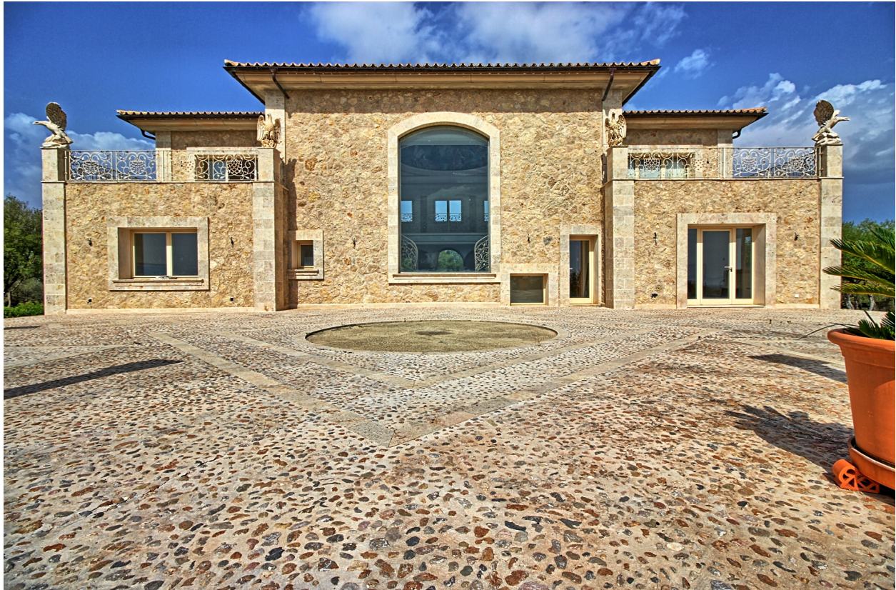
Santa Margalida - Impressive Finca near Muro