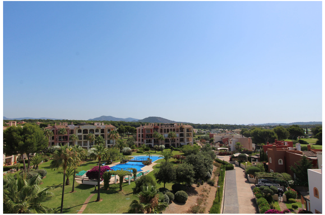
Santa Ponsa - Penthouse in luxurious residential zone in Santa Ponsa