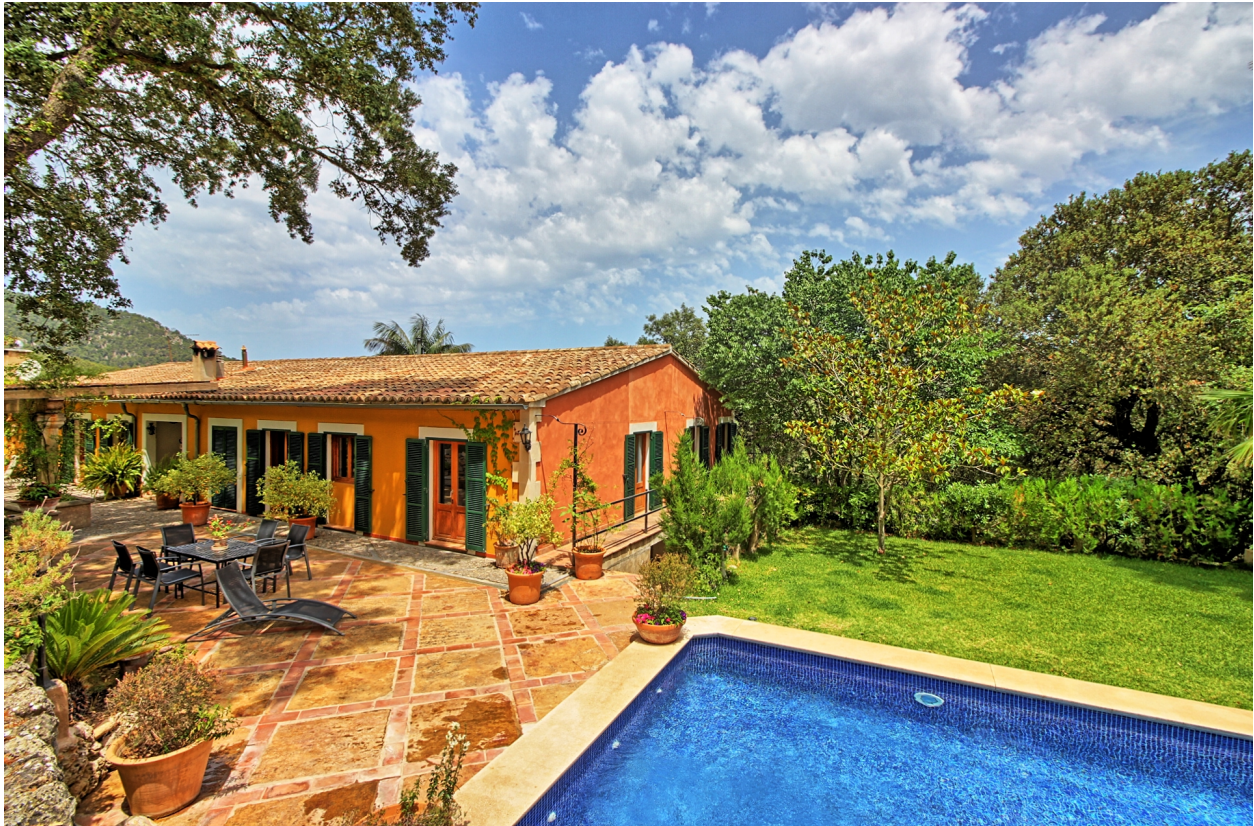
Esporles - Property on the hill of the mountain on a plot of 15.000 sqm