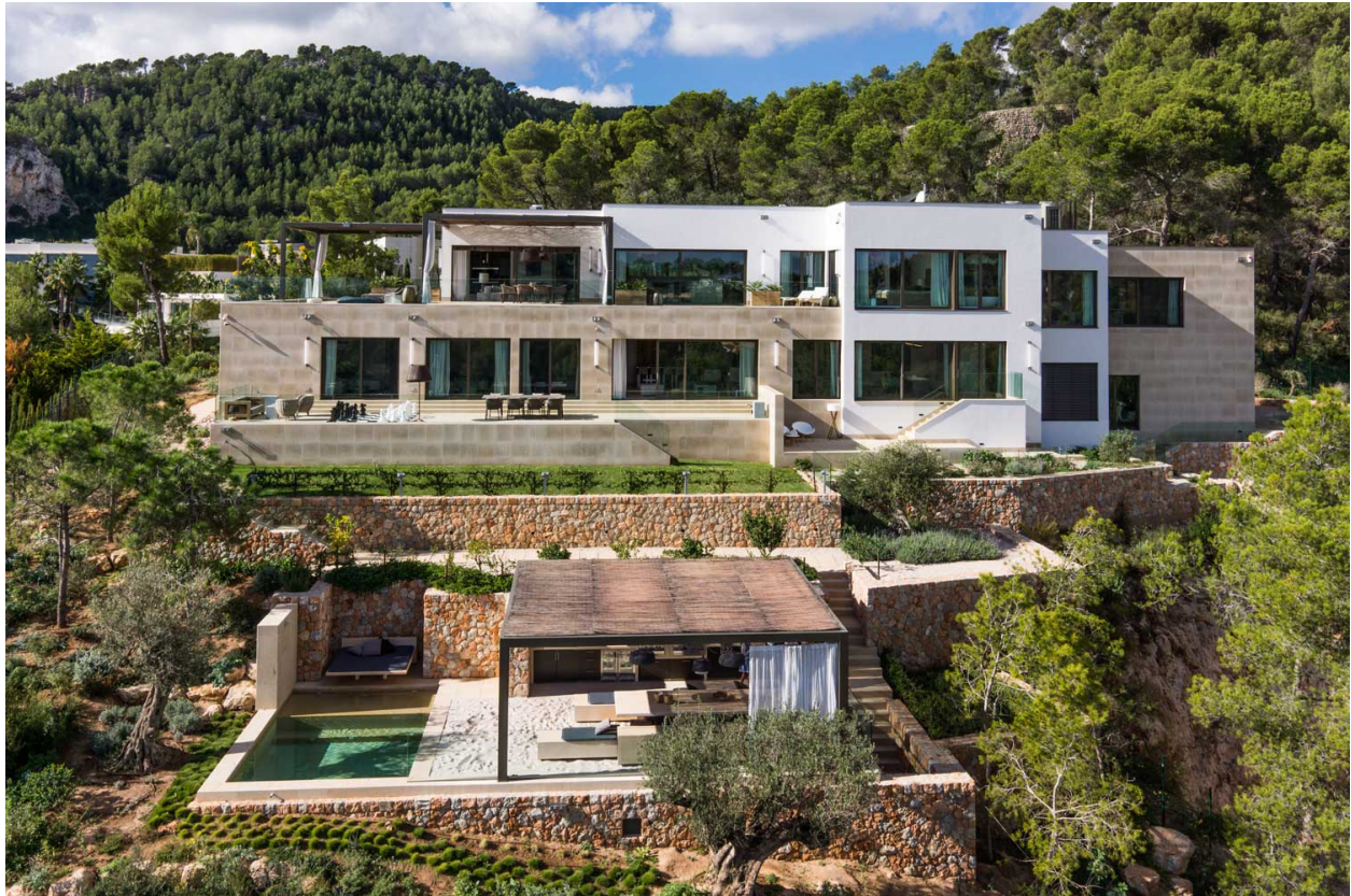
Son Vida - Unique Luxury Villa in Son Vida