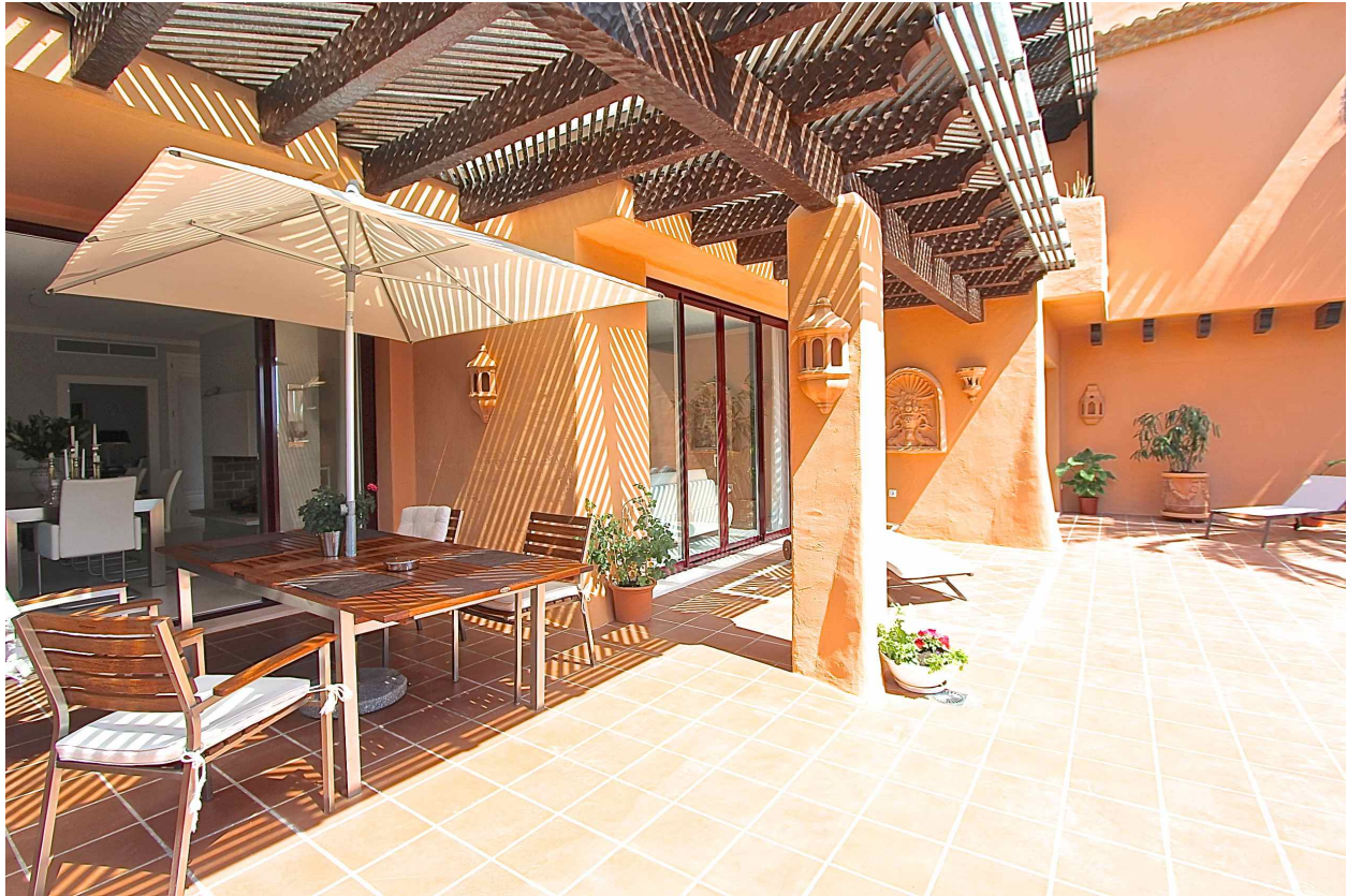
Santa Ponsa - Luxury penthouse apartment in Santa Ponsa