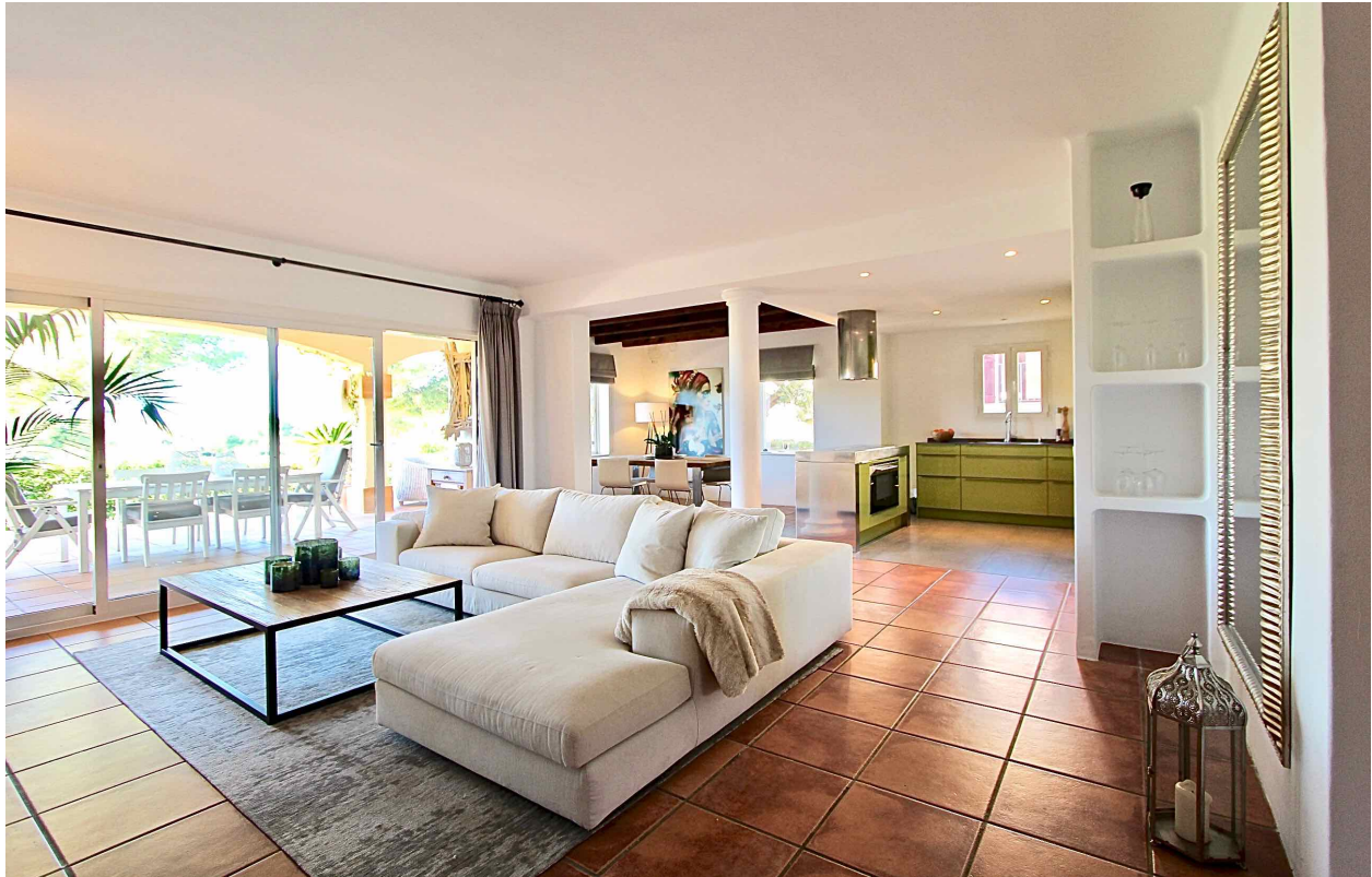
Nova Santa Ponsa - Beautiful Mediterranean Style Ground Floor Apartment in First Line Golf in Nova Santa Ponsa