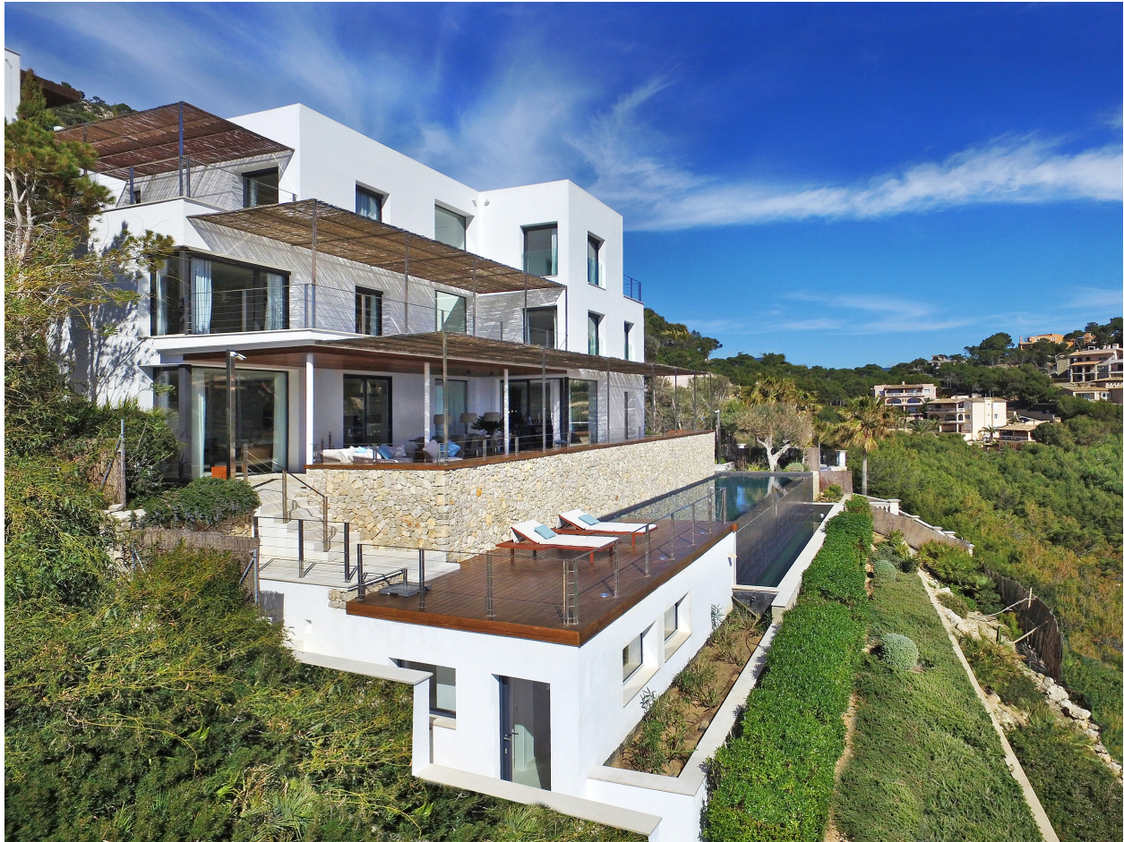
Port Andratx - Modern House with Panoramic Sea Views in Port Andratx