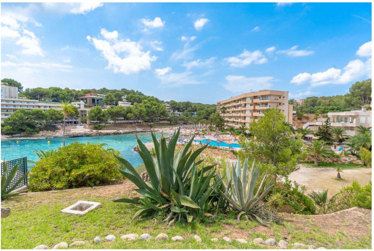
Cala Vinyas - Duplex Apartment with Access to the Nice Cala Vinyas Beach

Ground area -- Living area 100 m<sup>2</sup> Bedrooms 3 Bathrooms 3