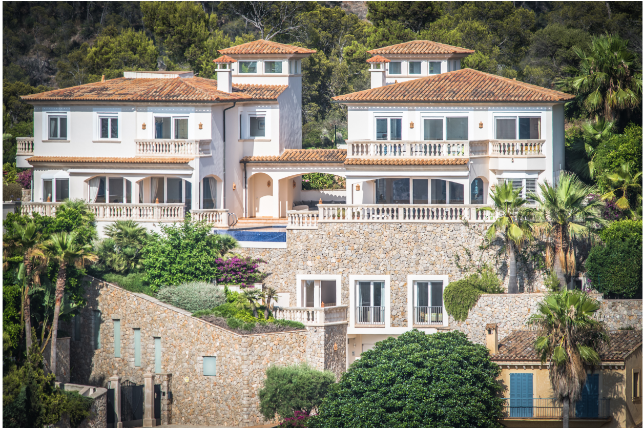
Port Andratx - Villa with Amazing Views in Port Andratx