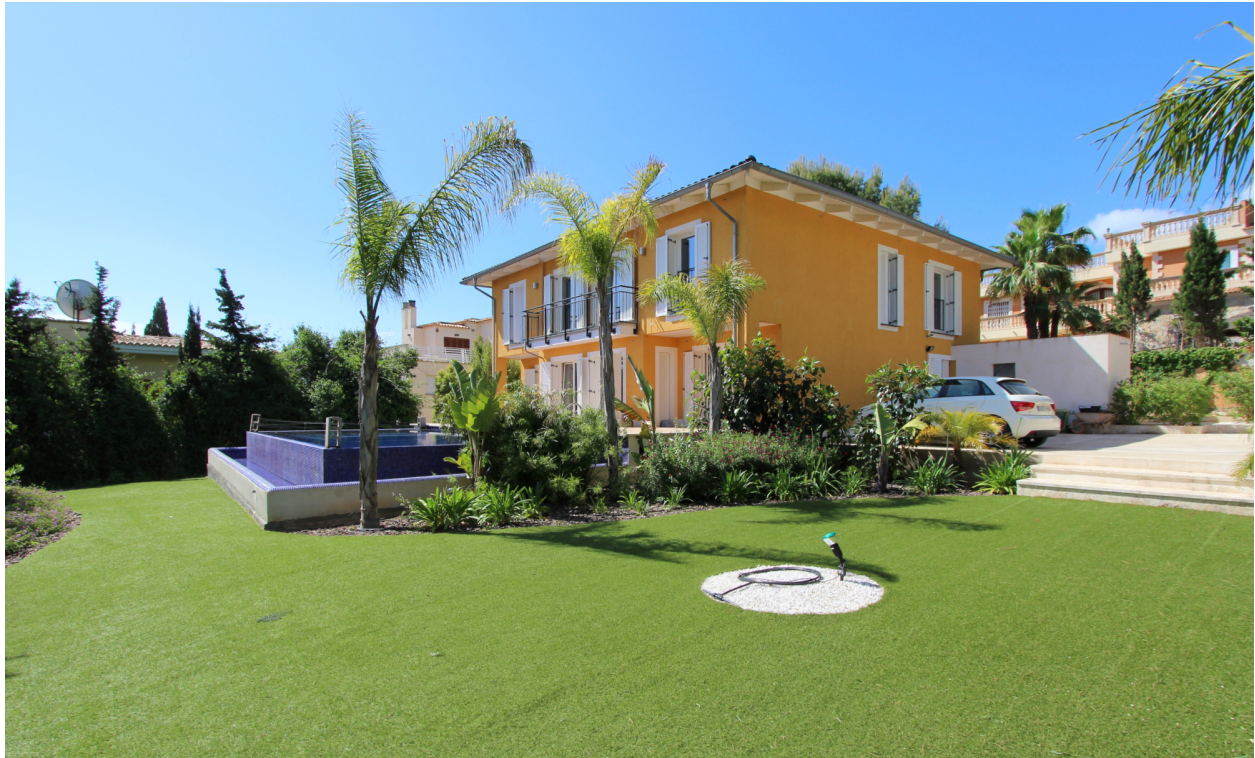
Torrenova - Beautiful Villa in Torrenova