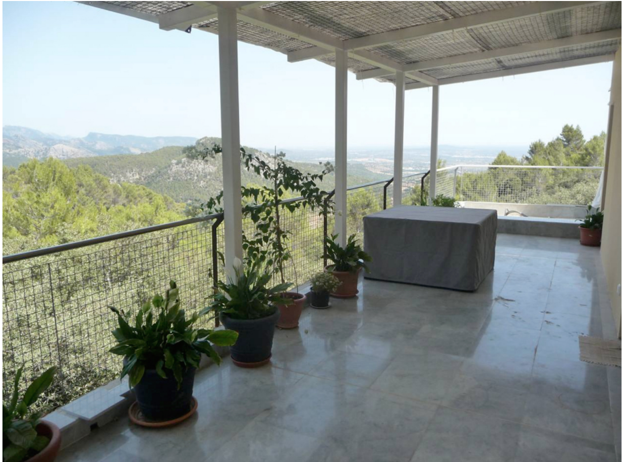
Esporles - Minimalistical House in the Tramuntana