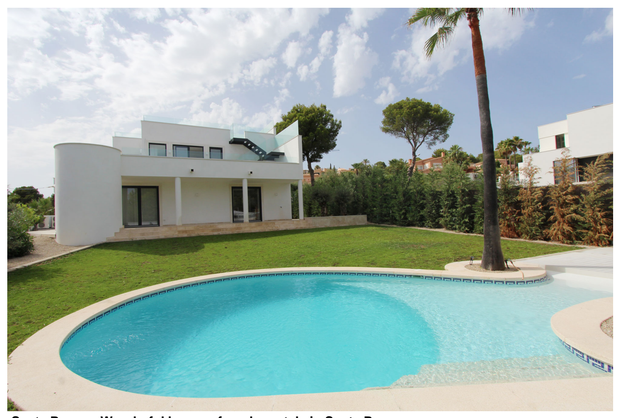
Santa Ponsa - Wonderful house of modern style in Santa Ponsa

Ground area Living area 400 m<sup>2</sup> 1200 m<sup>2</sup> Bedrooms Bathrooms