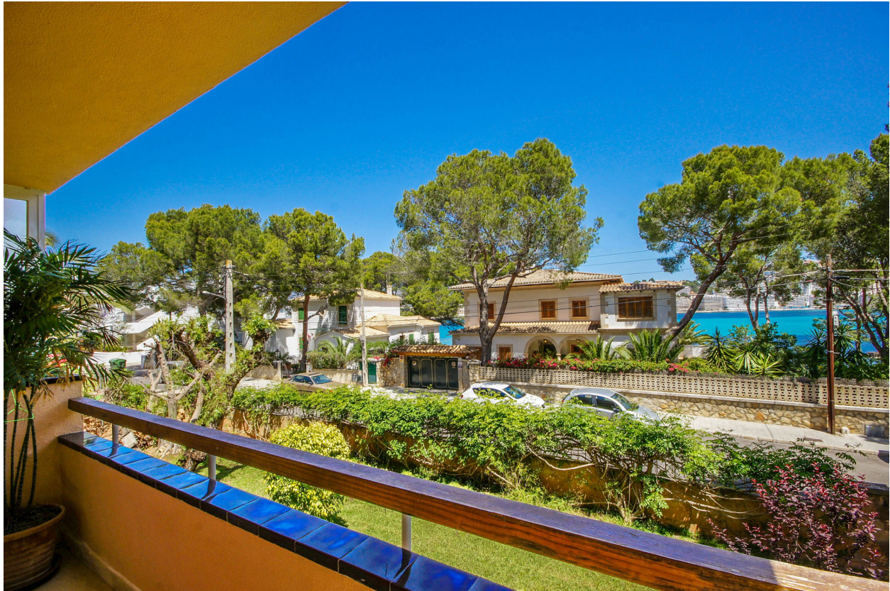
Santa Ponsa - Renovated Apartment with Wonderful Sea Views in Santa Ponsa