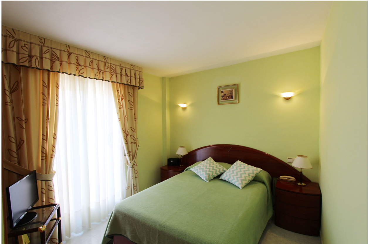
Son Ferrer - Apartment in Son Ferrer