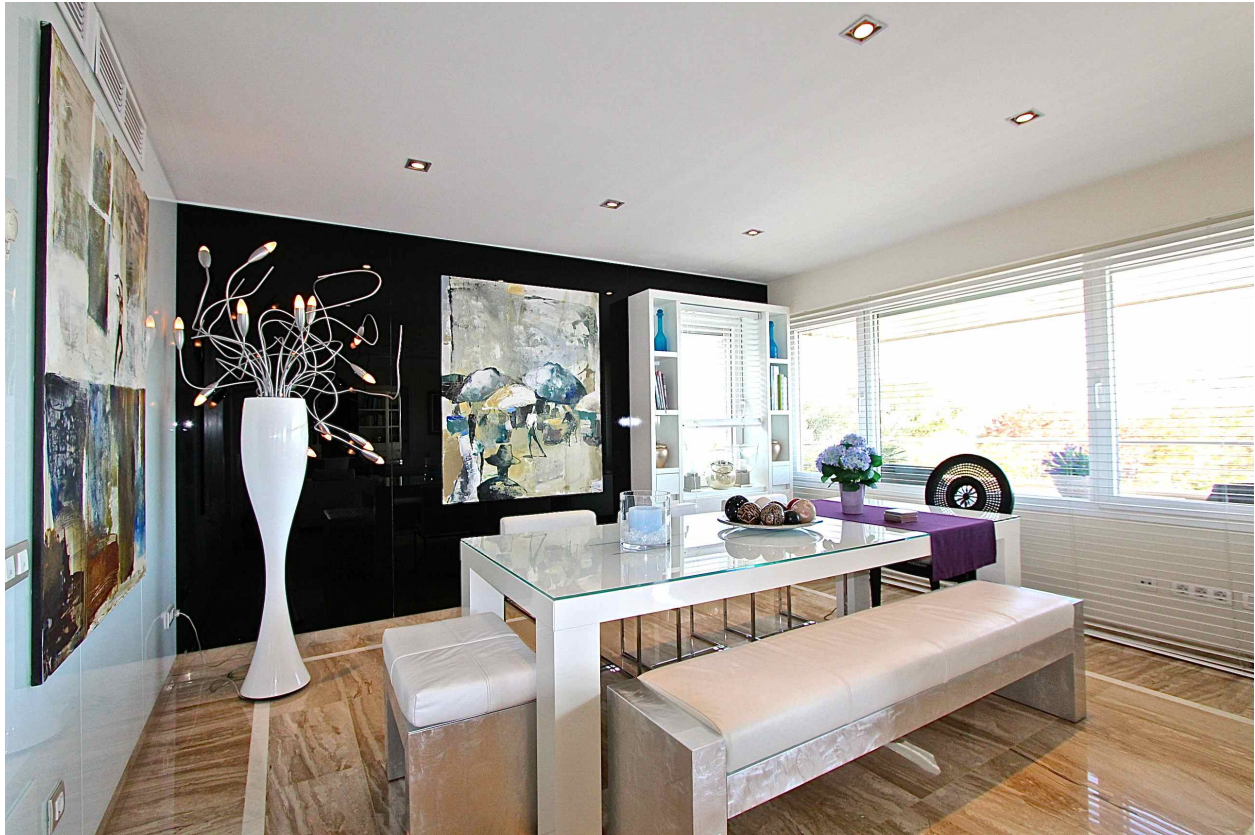
Palma de Mallorca - Spectacular apartment located directly at the Paseo Marítimo