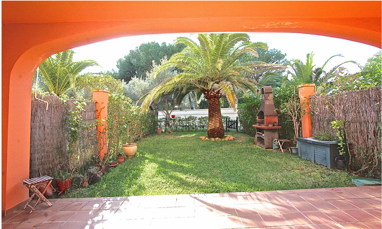
El Toro - Beautiful ground floor apartment in El Toro