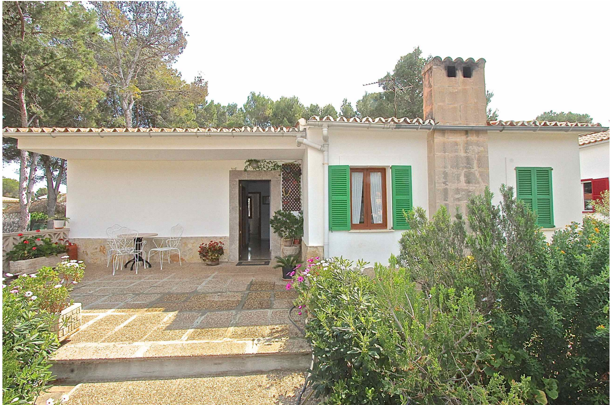
El Toro - Investment opportunity in El Toro