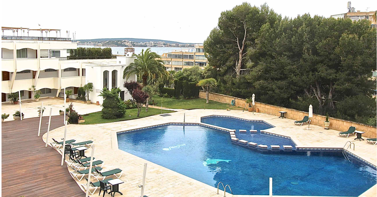
Puerto Portals - Large apartment with sea views located directly at the harbor of Portals