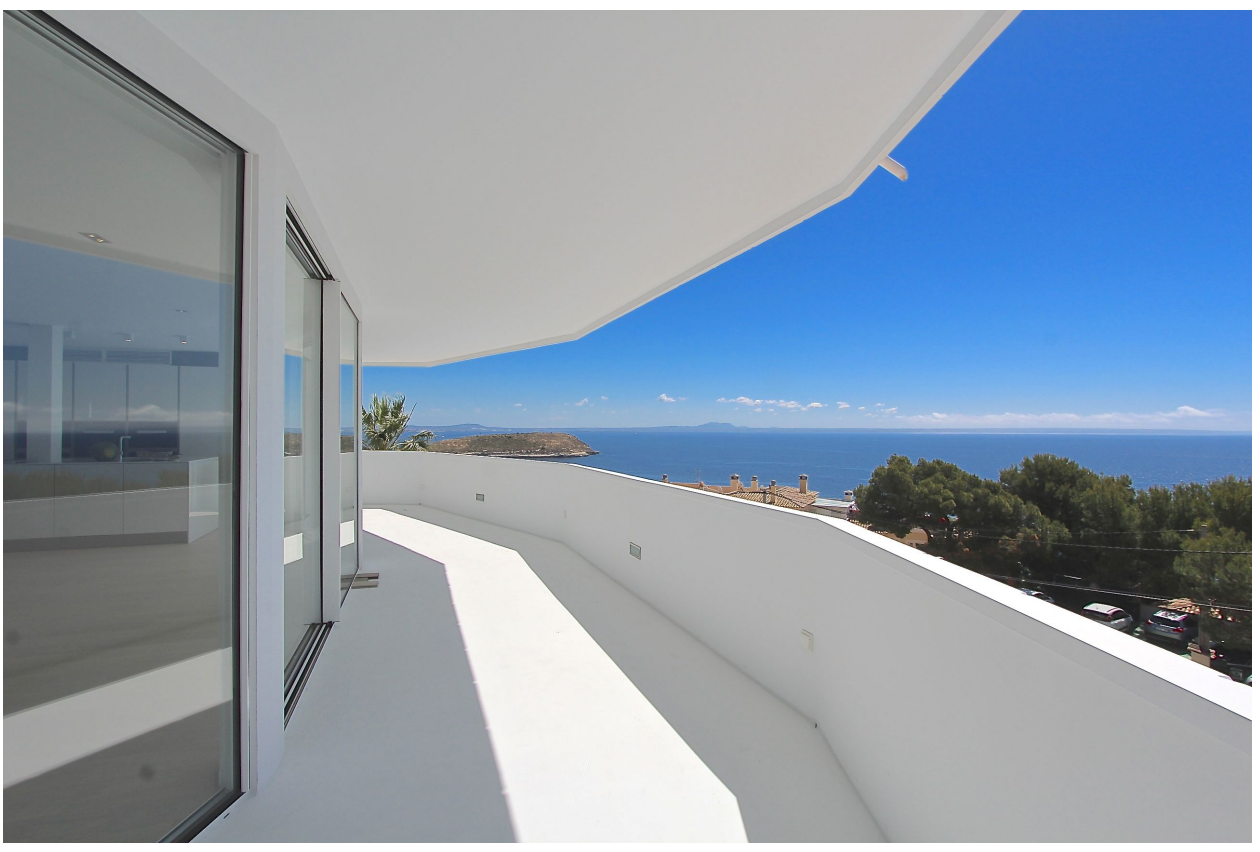
Cala Vinyas - Luxury penthouse with perfect sea views in Cala Vinyas

Ground area -- Living area 240 m² Bedrooms 3 Bathrooms 3