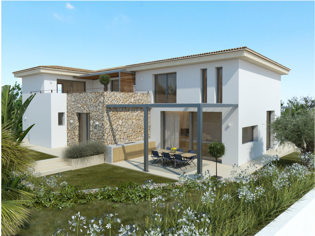
Nova Santa Ponsa - Elegant new villa project in Nova Santa Ponsa