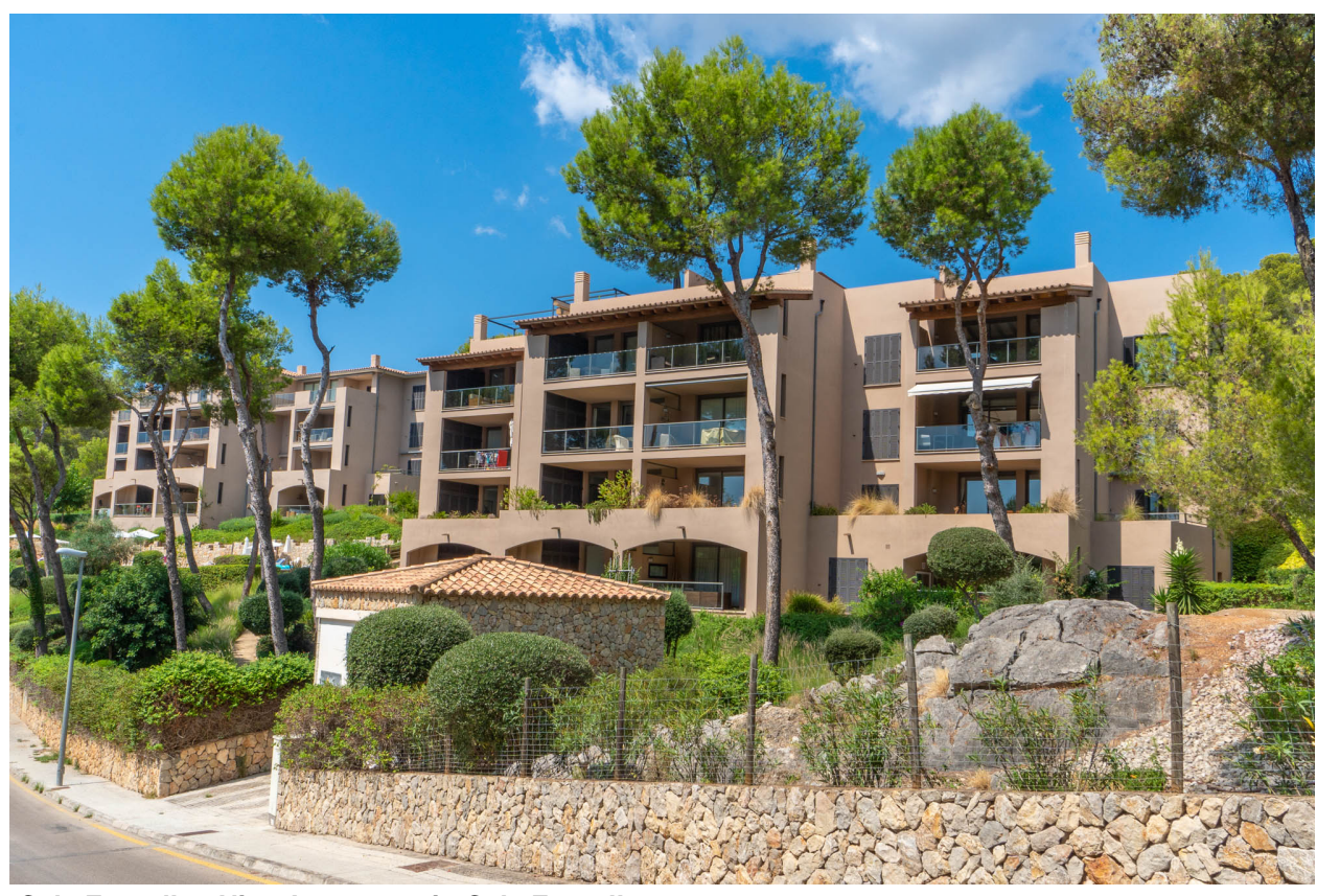
Cala Fornells - Nice Apartment in Cala Fornells

Ground area Living area 85 m<sup>2</sup> Bedrooms Bathrooms 2 2