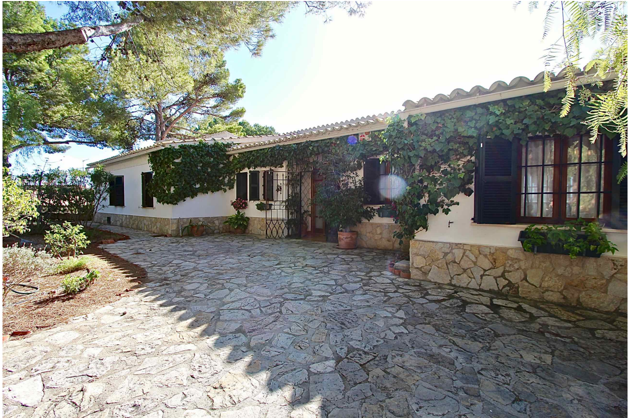
Costa den Blanes - Charming House with Sea Views in Costa d'en Blanes