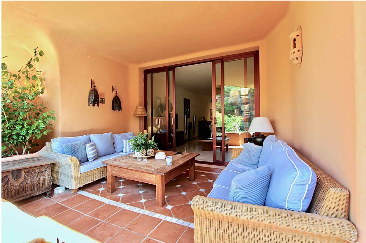
Nova Santa Ponsa - Ground Floor Apartment in a Luxury Development in Nova Santa Ponsa