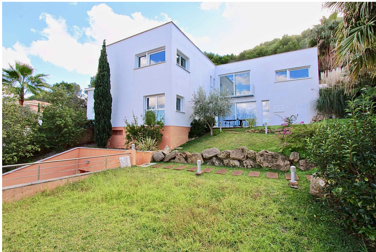
Santa Ponsa - Modern Villa in Nova Santa Ponsa