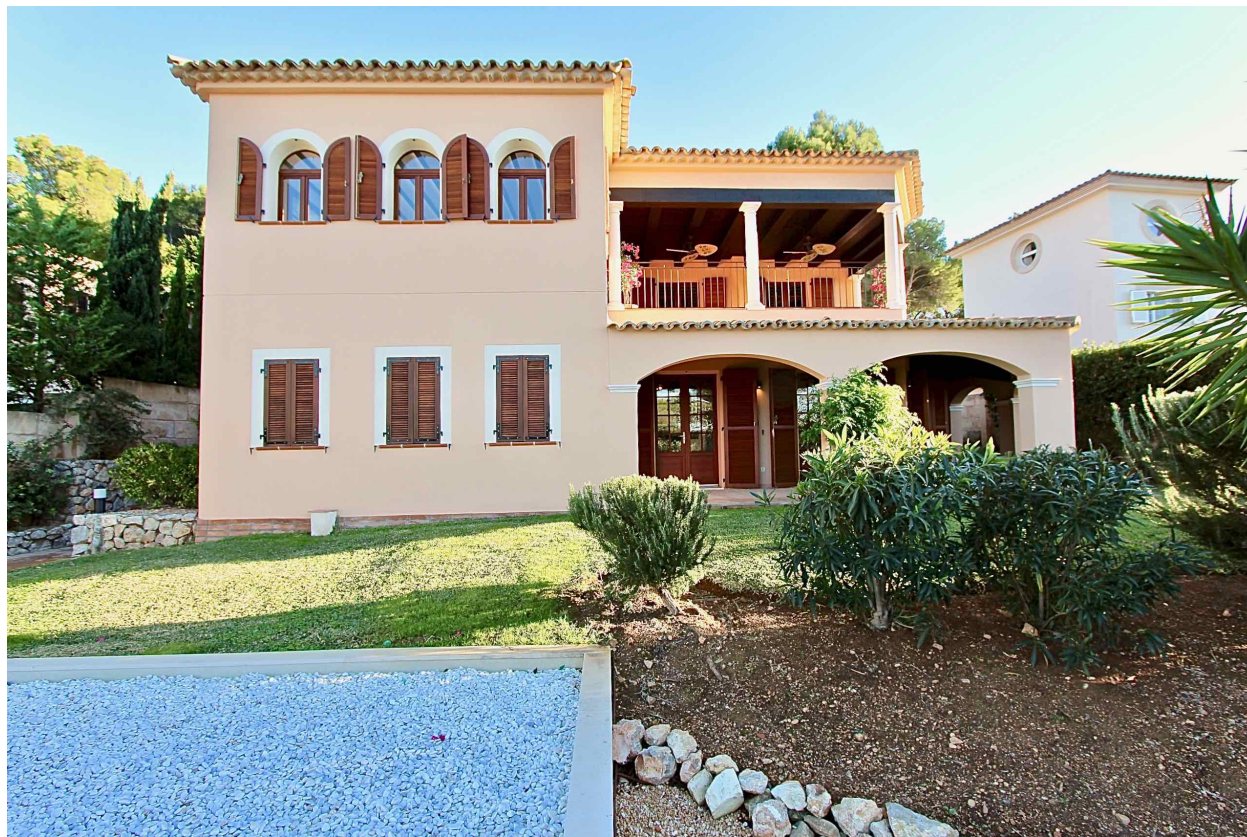
Santa Ponsa - Beautiful Rustic Style House in Nova Santa Ponsa