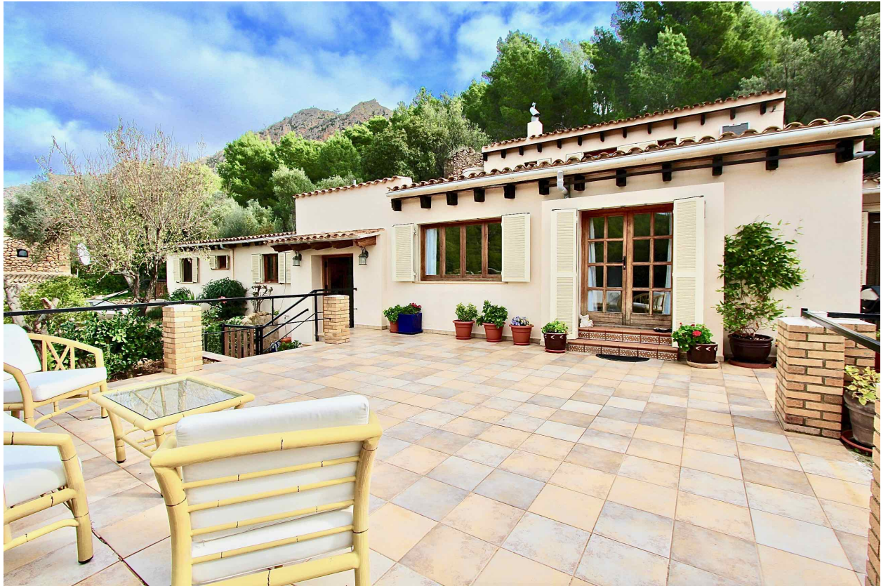
Andratx - Beautiful Rustic house in a Peaceful Area of Andratx