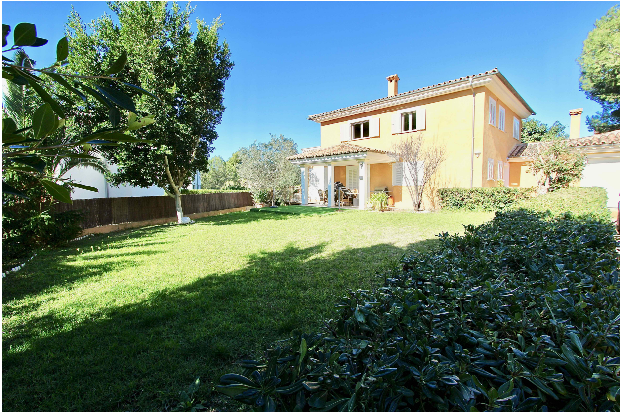
Nova Santa Ponsa - Large House in Nova Santa Ponsa