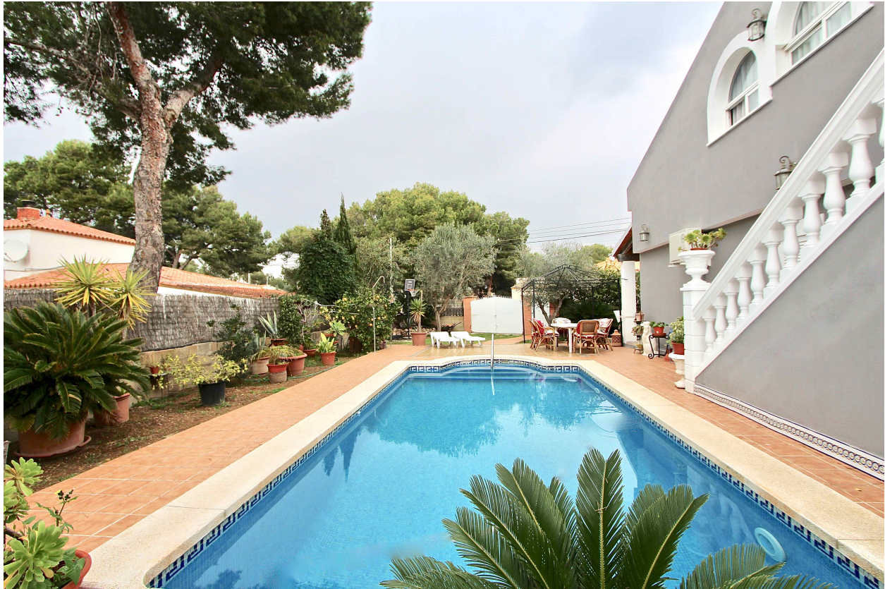
El Toro - Spacious Villa in El Toro