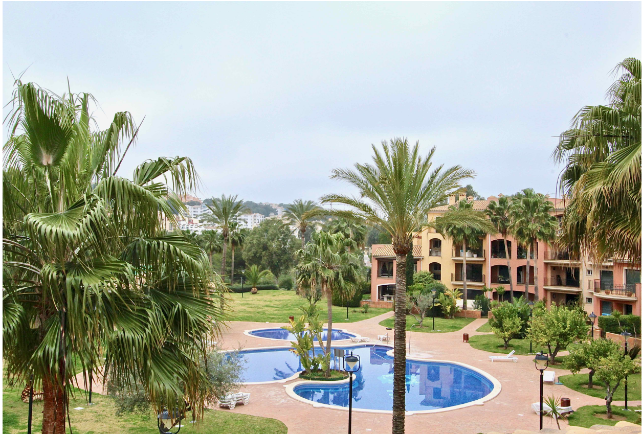
Santa Ponsa - Duplex in a Luxury Urbanization Close to the Golf Course in Santa Ponsa