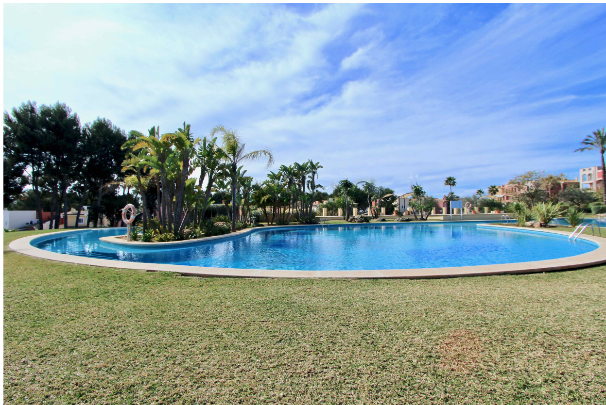
Nova Santa Ponsa - Apartment in a luxury complex in Nova Santa Ponsa.