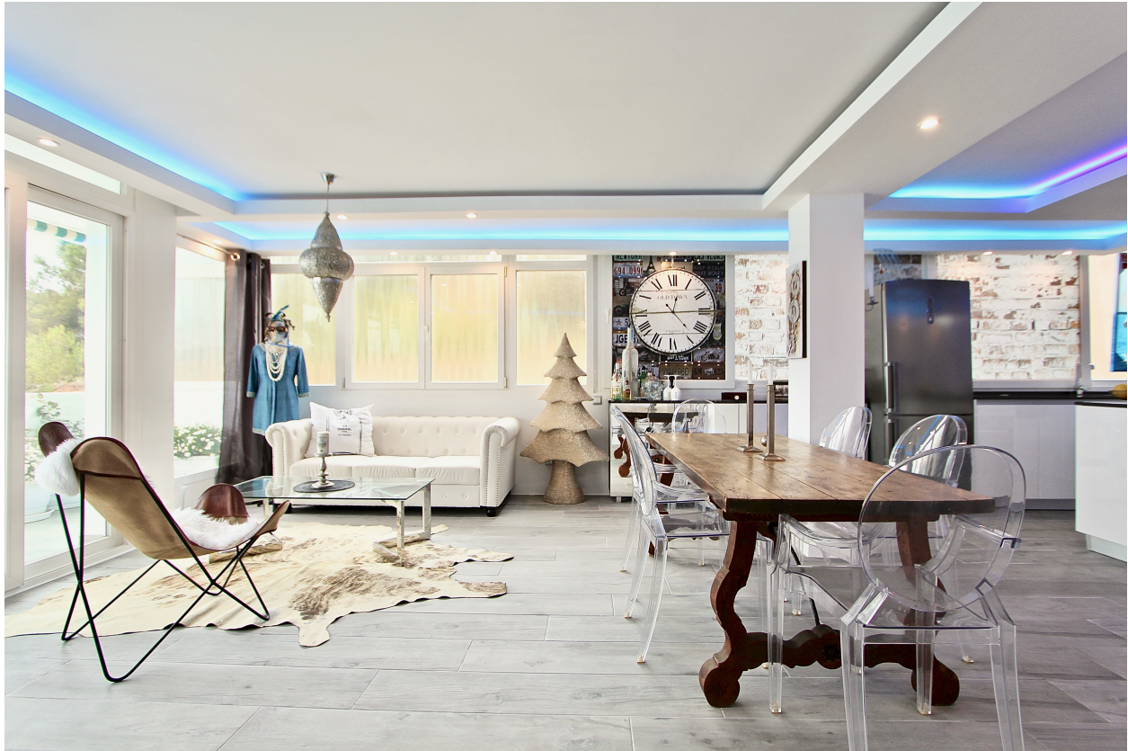
El Toro - Beautiful Apartment Overlooking the Sea in El Toro