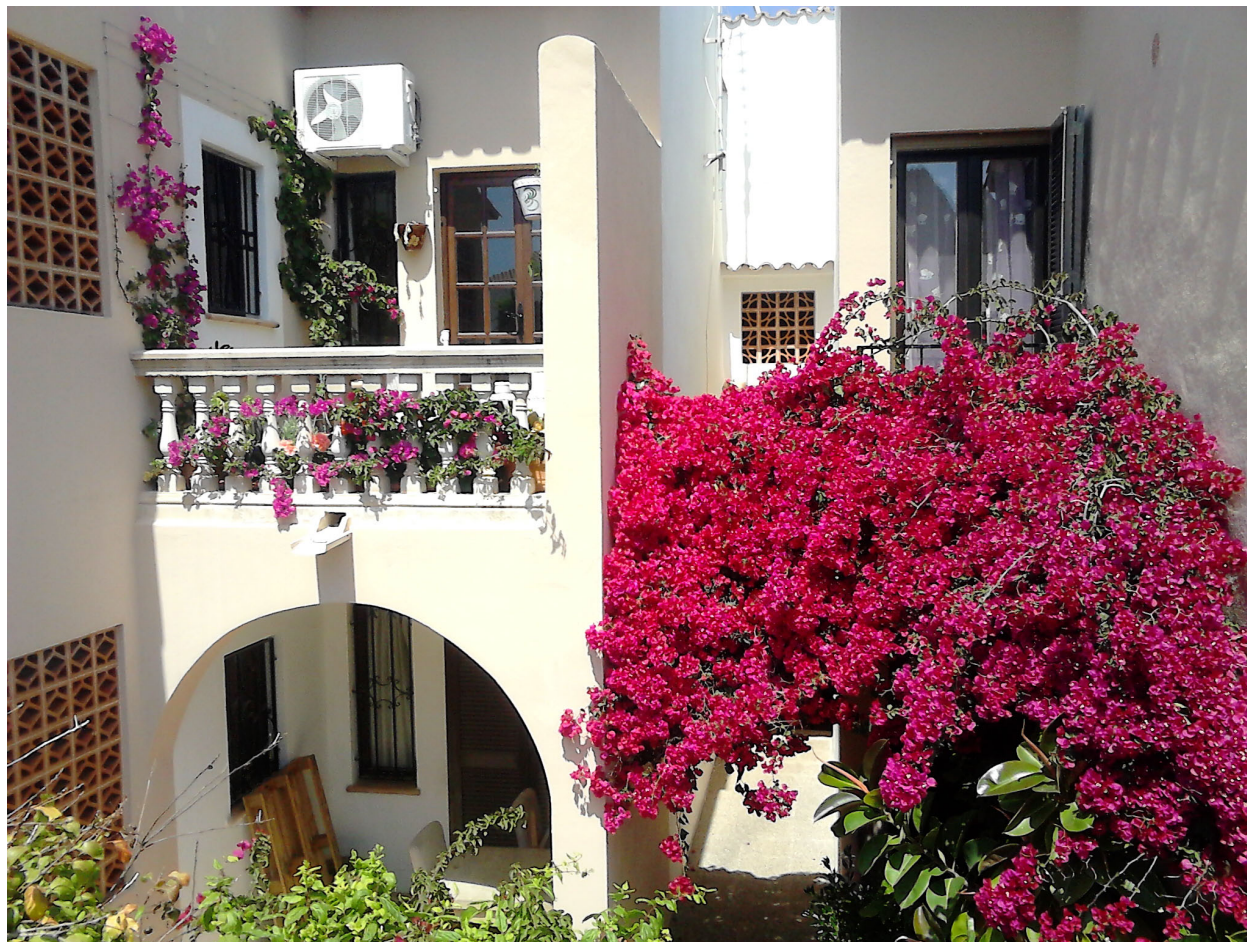
Santa Ponsa - Beautiful Renovated Apartment in Santa Ponsa