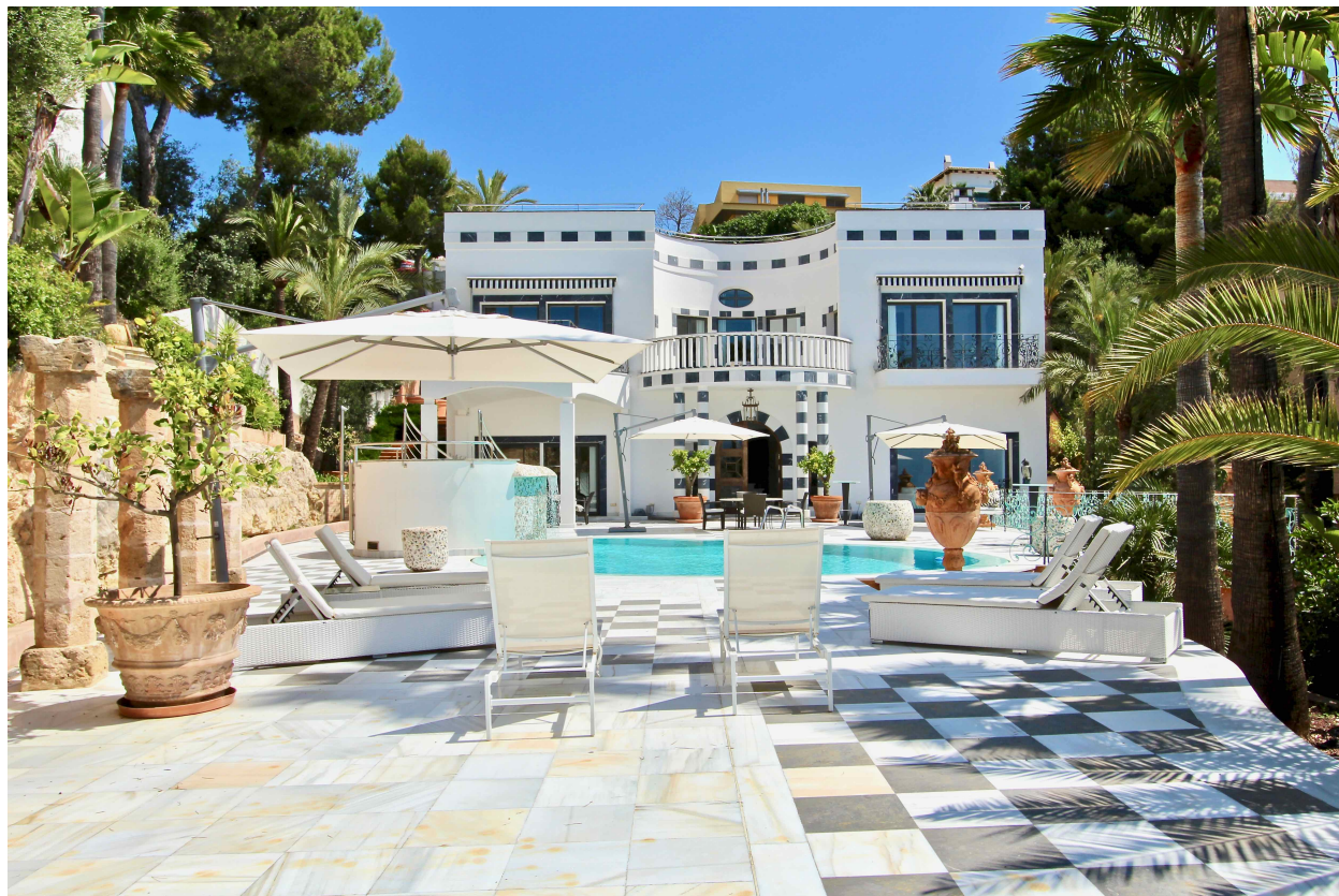
Bendinat - Exclusive Villa with Panoramic Sea Views in Bendinat