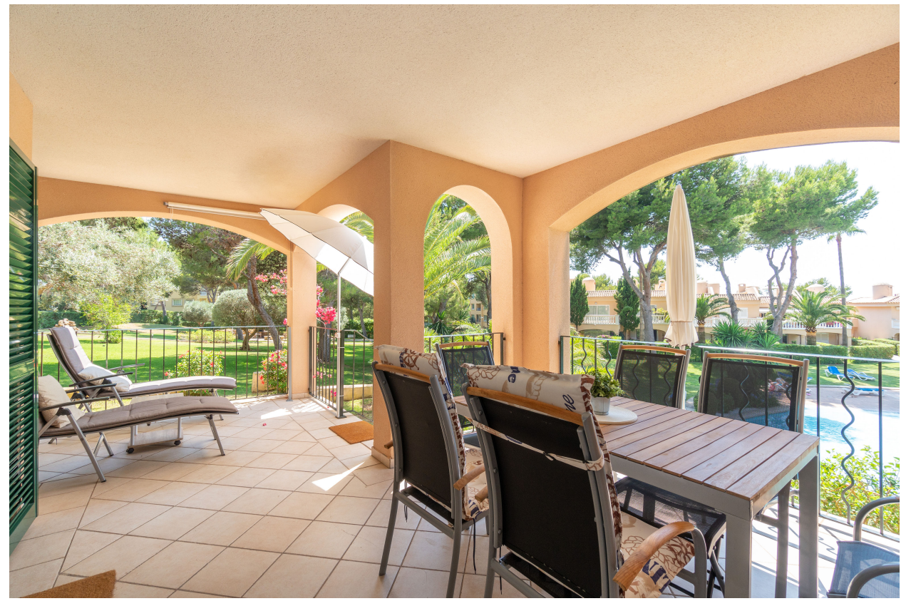
Nova Santa Ponsa - Beautiful Ground Floor Apartment of Mediterranean Style in Nova Santa Ponsa