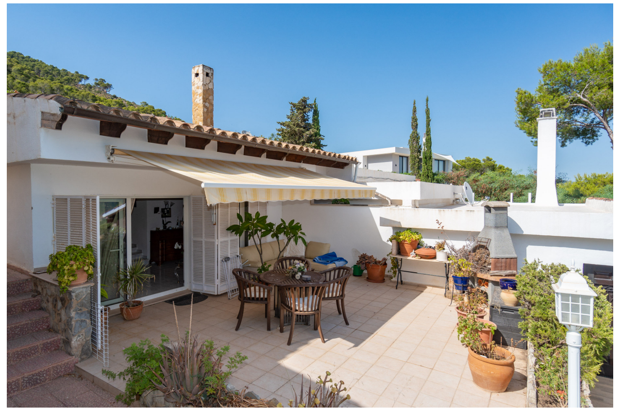
Paguera - Bungalow in a Quiet Residential Area in Paguera