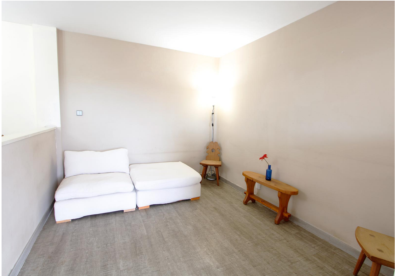
Son Ferrer - Ground Floor with Large Garden in Son Ferrer