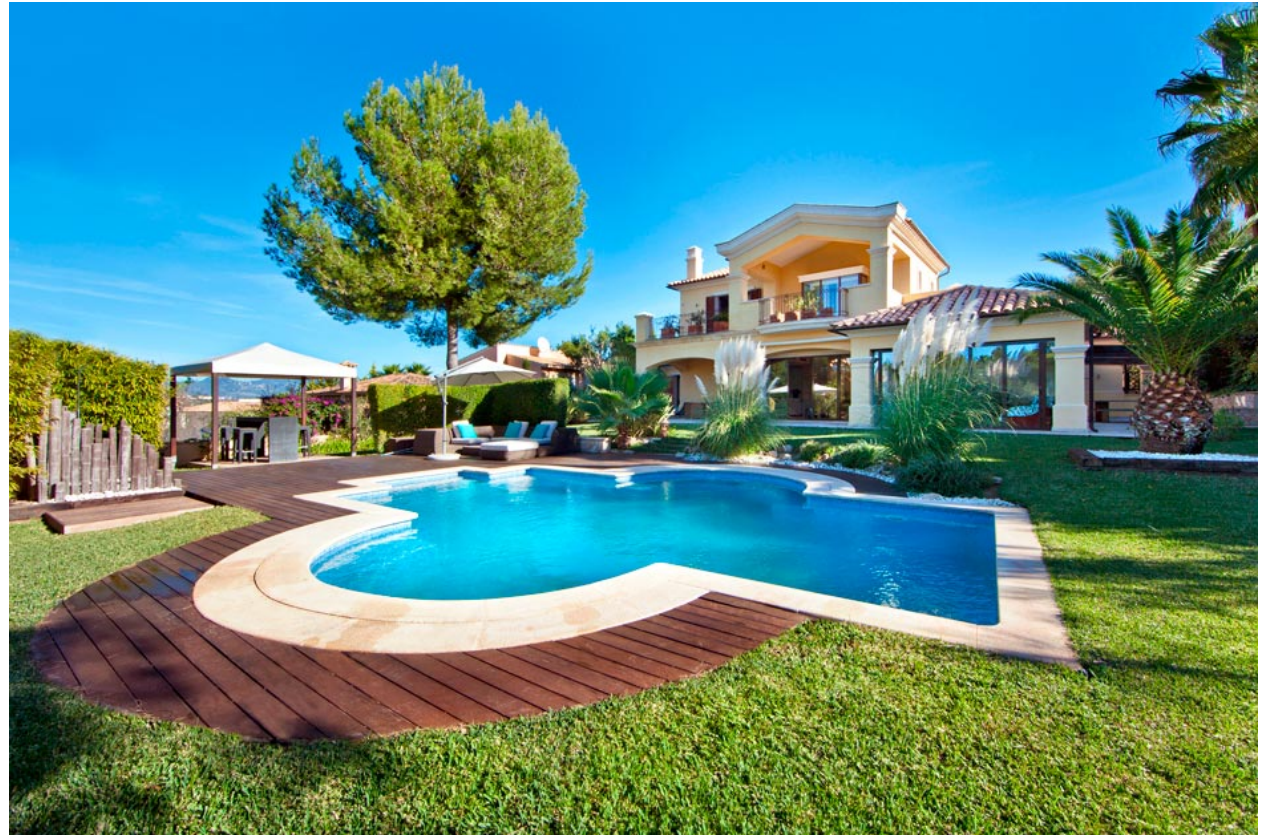
Nova Santa Ponsa - Villa with Pool in Nova Santa Ponsa