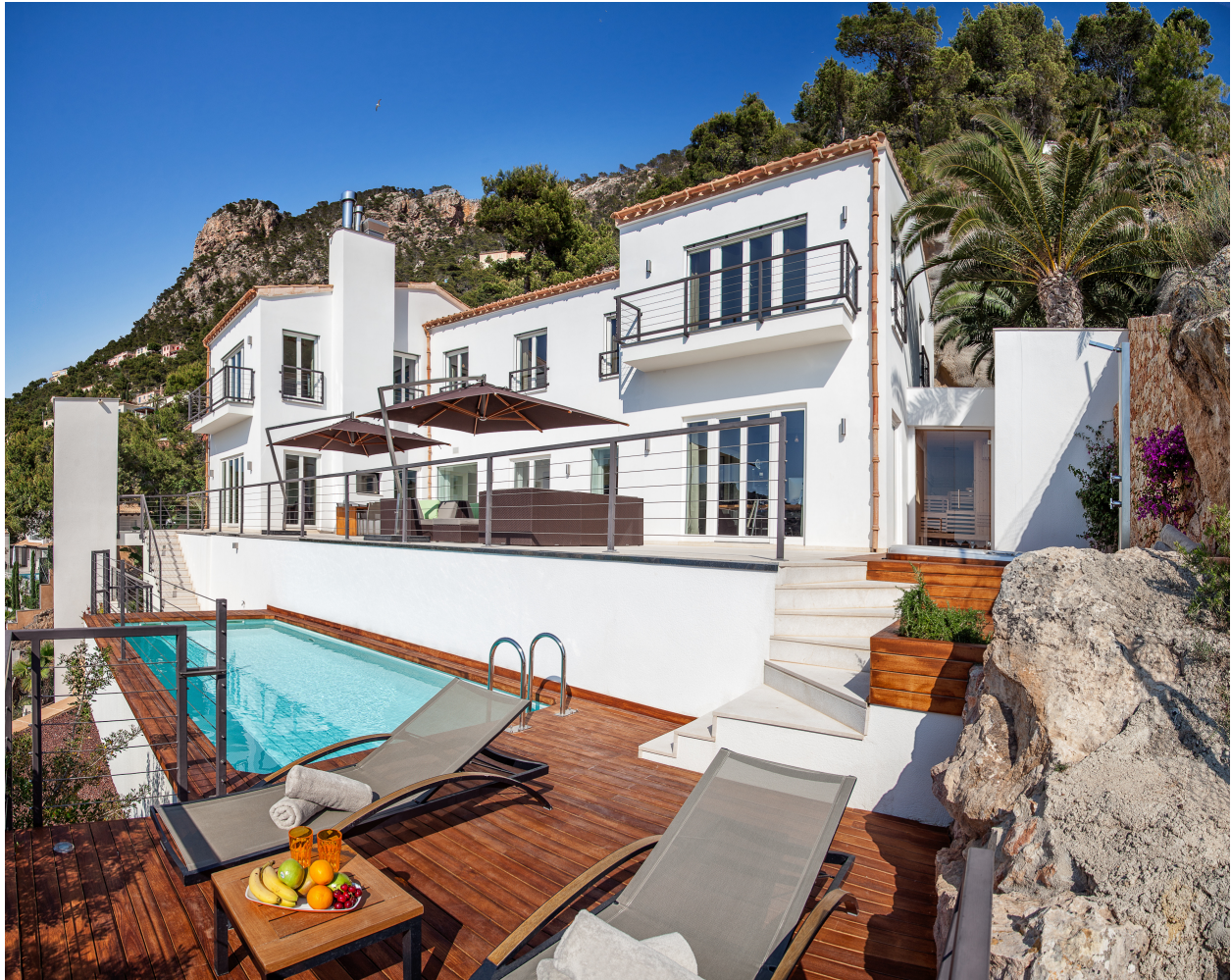
Andratx - LUXURY VILLA WITH SEA VIEWS IN PORT ANDRATX