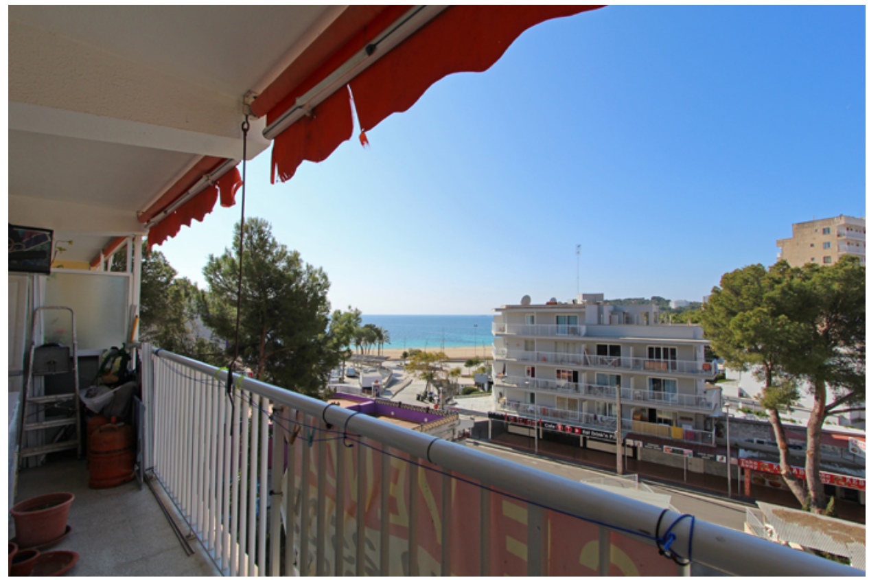
Magaluf - STUNNING APARTMENT WITH AMAZING SEA VIEWS IN MAGALUF

Ground area--Living area 72 \text{ m}^2 Bedrooms3Bathrooms2