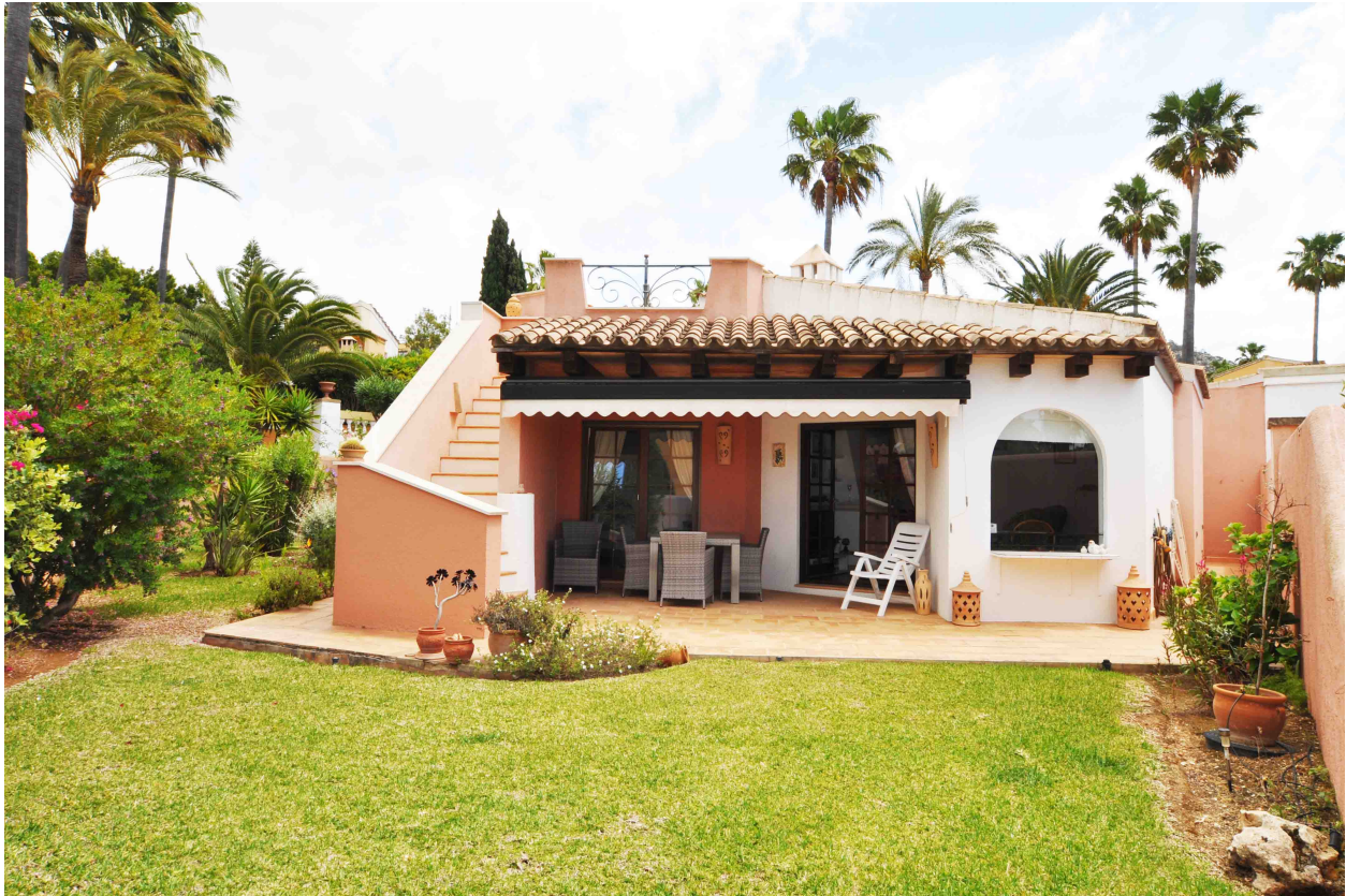
Santa Ponsa - WONDERFUL SMALL HOUSE IN A VERY WELL MAINTAINED COMPLEX IN SANTA PONSÁ