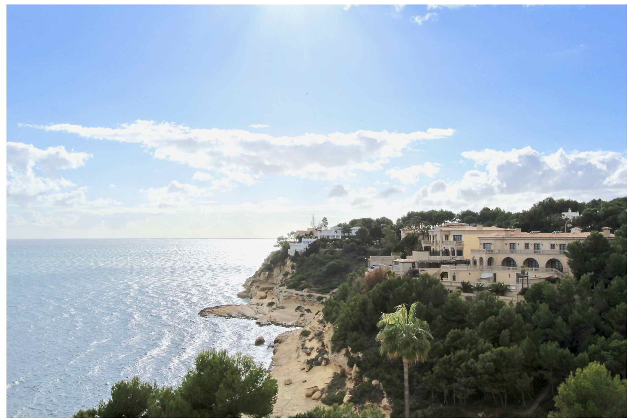
Sol de Mallorca - Spectacular penthouse for rent on the 1st line of the sea in Sol de Mallorca