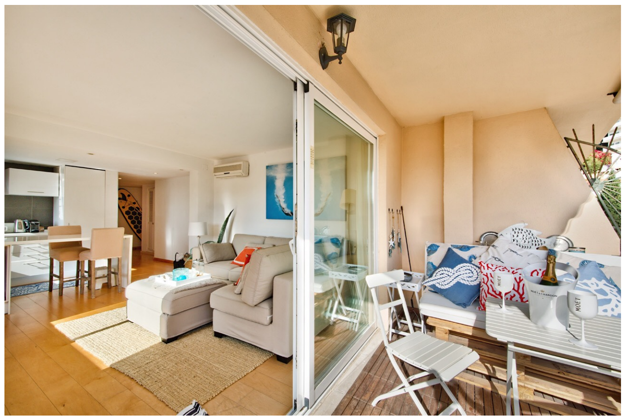
Portals Nous - Apartment Near to the Beach in Portals Nous

Ground area Living area 83 m<sup>2</sup> Bedrooms Bathrooms 2