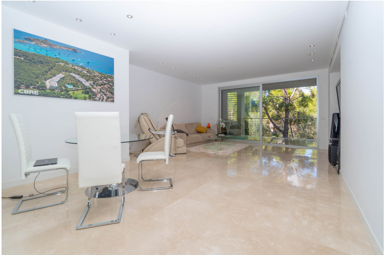
Bendinat - Wonderful Apartment in a Luxurious Complex in Bendinat