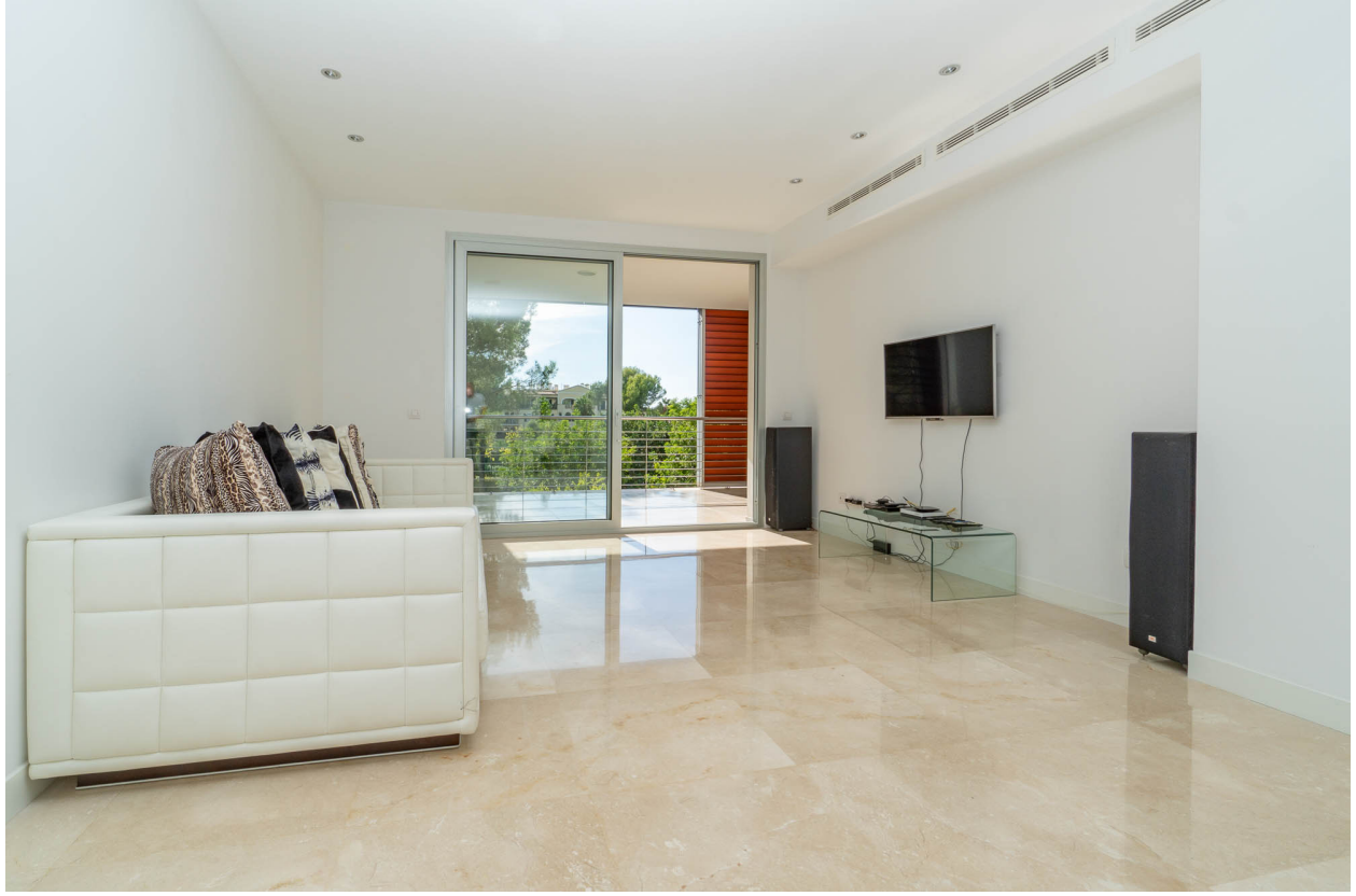
Bendinat - Wonderful Apartment in a Luxurious Complex in Bendinat